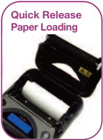
Quick Release Paper Loading