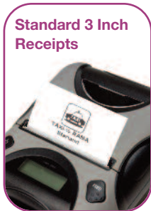
Standard 3 Inch Receipts