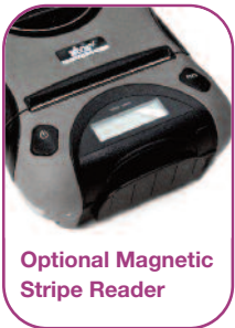
Optional Magnetic Stripe Reader